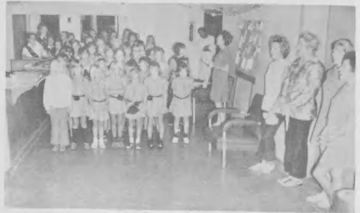
During Christmas season, the Girl Scouts of Seroe Colorado brought Christmas spirit to the patients of Lago Hospital with their caroling.

Durante tempo di Pascu, e Padvindsters di Seroe Colorado a trece espiritu di Pascu na e pacientnan di Lago Hospital cu nan canticanan.